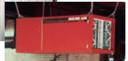
Ambient Air Cleaners